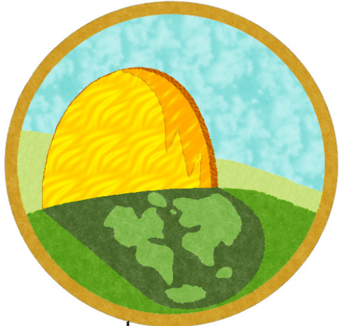
Haystack Meeting, 1808